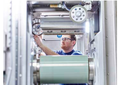
Easy accessibility for higher uptime