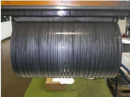
Long load length for more output