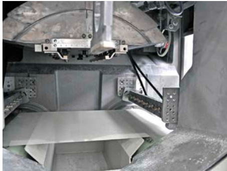
Variety of options for more flexibility