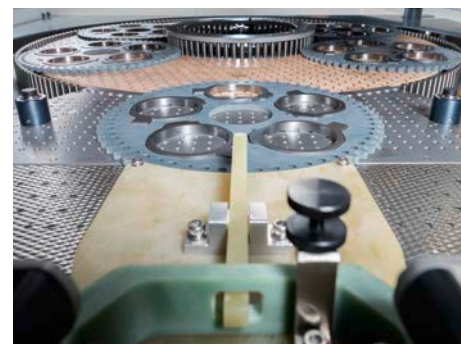
AC 880-F with gap loading table and loading tool