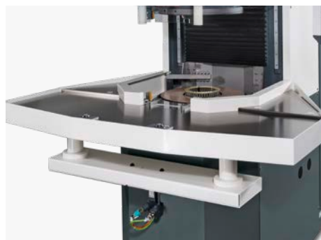
AC 400-F gap loading table for comfortable machine operation