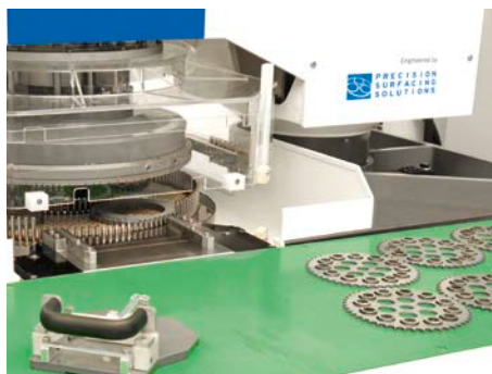
AC 535-F with gap loading table