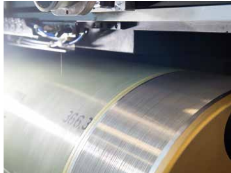
Thin wire for lower cost