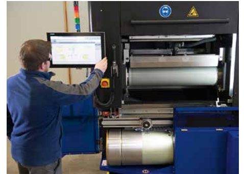
Easy operation for higher yield