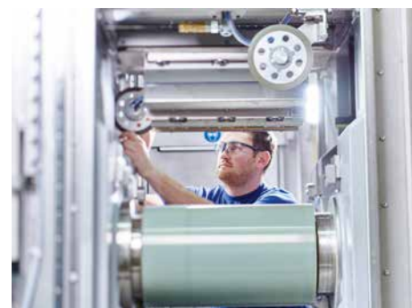
Easy accessibility for higher uptime