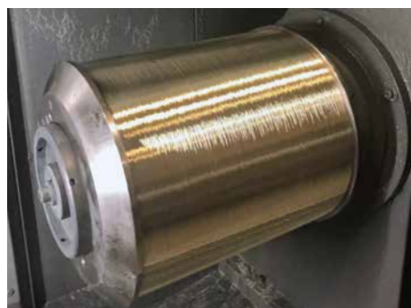
High wire volume for higher capacity