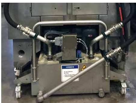
Optimized cutting fluid system for lower downtime