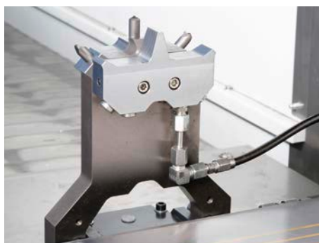
Tilt dressing unit with 3 diamonds