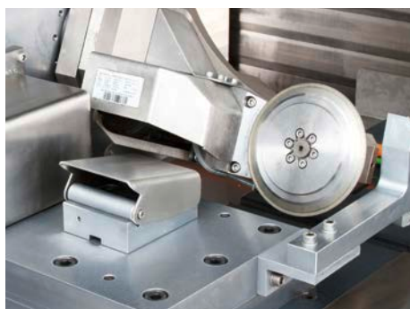
CNC swivel dresser with disc