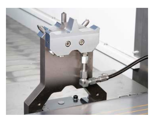
Tilt dressing unit with 3 diamonds