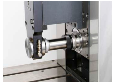
Head mounted diamond roll dressing unit