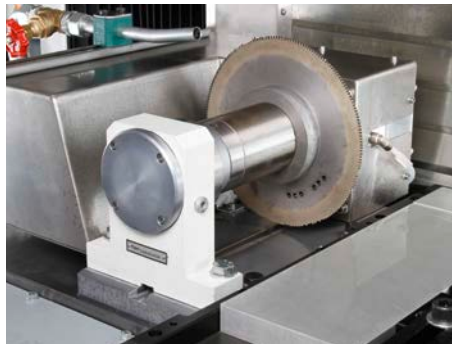
Profile dressing unit