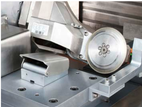
CNC swivel dresser with disc